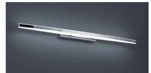
12 W, 2900 K, 850 Lumen, CRI > 90 18/1936.04