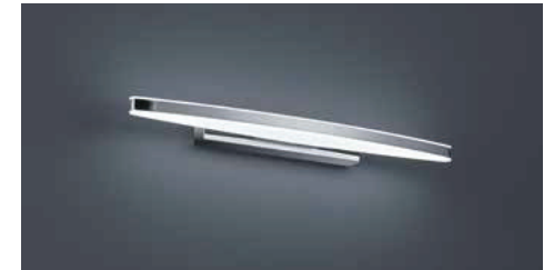
9 W, 2900 K, 650 Lumen, CRI > 90 18/1935.04

chrom Acrylglas satiniert chrome acrylic glass satinised